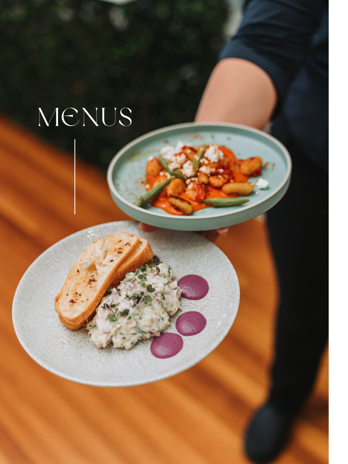
Table Service Menu

Main - $45 Per Person Main & Dessert - $65 Per Person Entree & Main - $70 Per Person Entree, Main & Dessert - $90 Per Person Chef's selection of three canapes - $16 Per Person